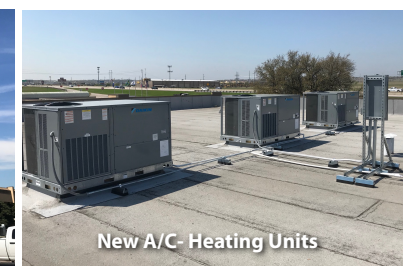
New A/C - Heating Units