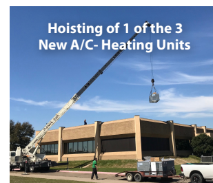
Hoisting of 1 of the 3 New A/C - Heating Units