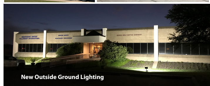
New Outside Ground Lighting