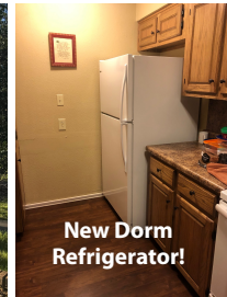
New Dorm Refrigerator!