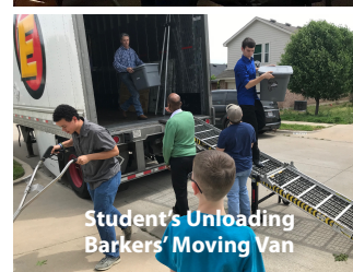
Student's Unloading Barkers' Moving Van