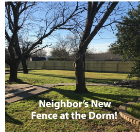
Neighbor's New Fence at the Dorm!