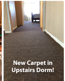
New Carpet in Upstairs Dorm!