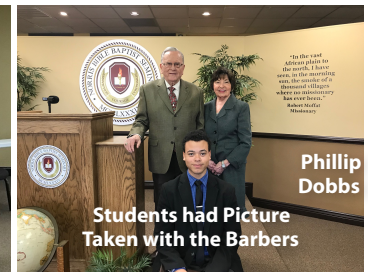
Students had Picture Taken with the Barbers