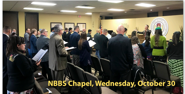
NBBS Chapel, Wednesday, October 30

By the time you receive this, NBBS will be less than three weeks away from ending another 17-week semester. Our new students are into the flow and our potential graduating seniors are well on their way to finishing strong in May.